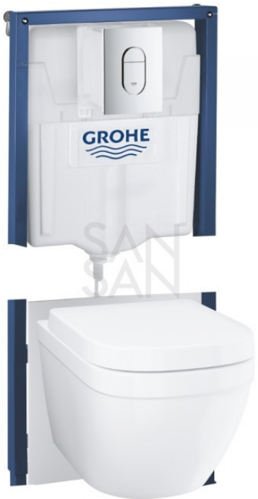
Toilet - GROHE EURO CERAMIC 4-IN-1