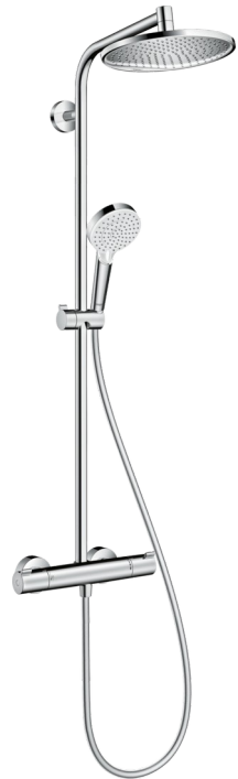
Shower system - HANSGROHE CROMETTA S 240